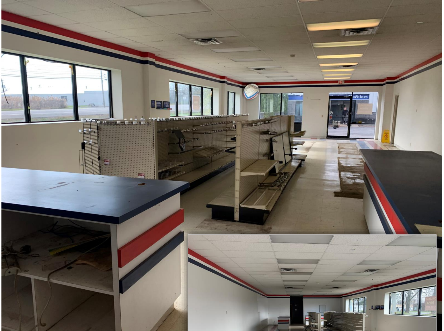
Front retail showroom

COMMERCIAL REAL ESTATE SALES | LEASING | CONSULTING | DEVELOPMENT | MANAGEMENT