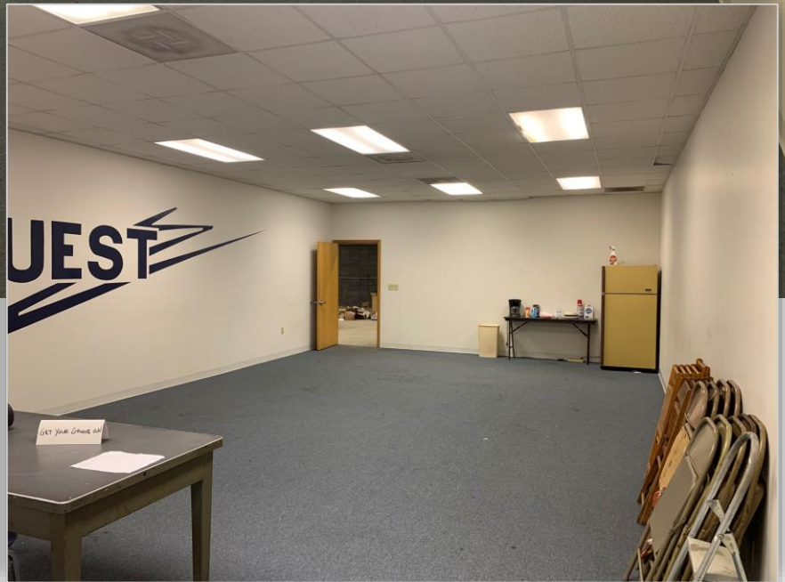
Training & conference room