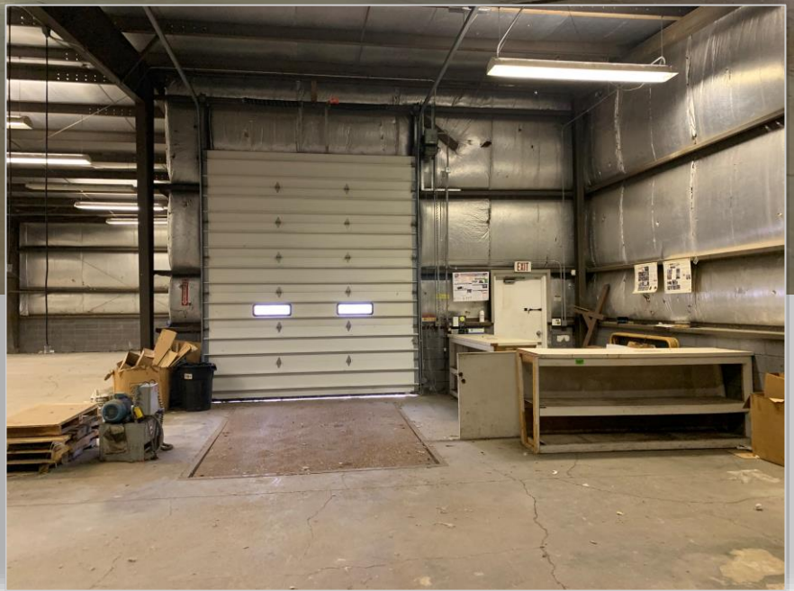
Warehouse and loading area